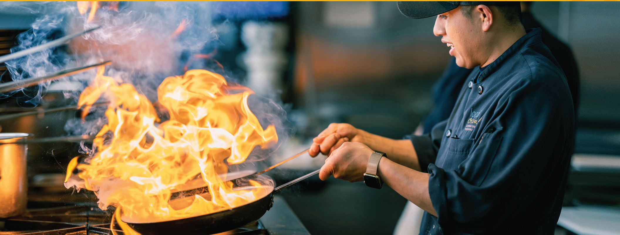
Employee-owner at Local Ocean Seafood

household wealth, and 36% longer job tenure. A 2019 study showed that employee-owners have dramatically more wealth than comparable workers at businesses without employee ownership and that the difference is particularly significant for Black and Latino employee-owners.