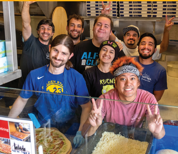
Employee-owners at A Slice of NY

ownership have experienced an average 20% increase in wages. In example case studies: a Silicon Valley pizza shop shared over $1 million in profits with its workers in its first five years as a worker-owned cooperative; a Los Angeles bakery shared roughly $15,000 apiece with each of its workers in their first year of employee ownership; a Minneapolis cleaning company was able to reinstate a previously discontinued IRA program for all its workers with 3% company match.