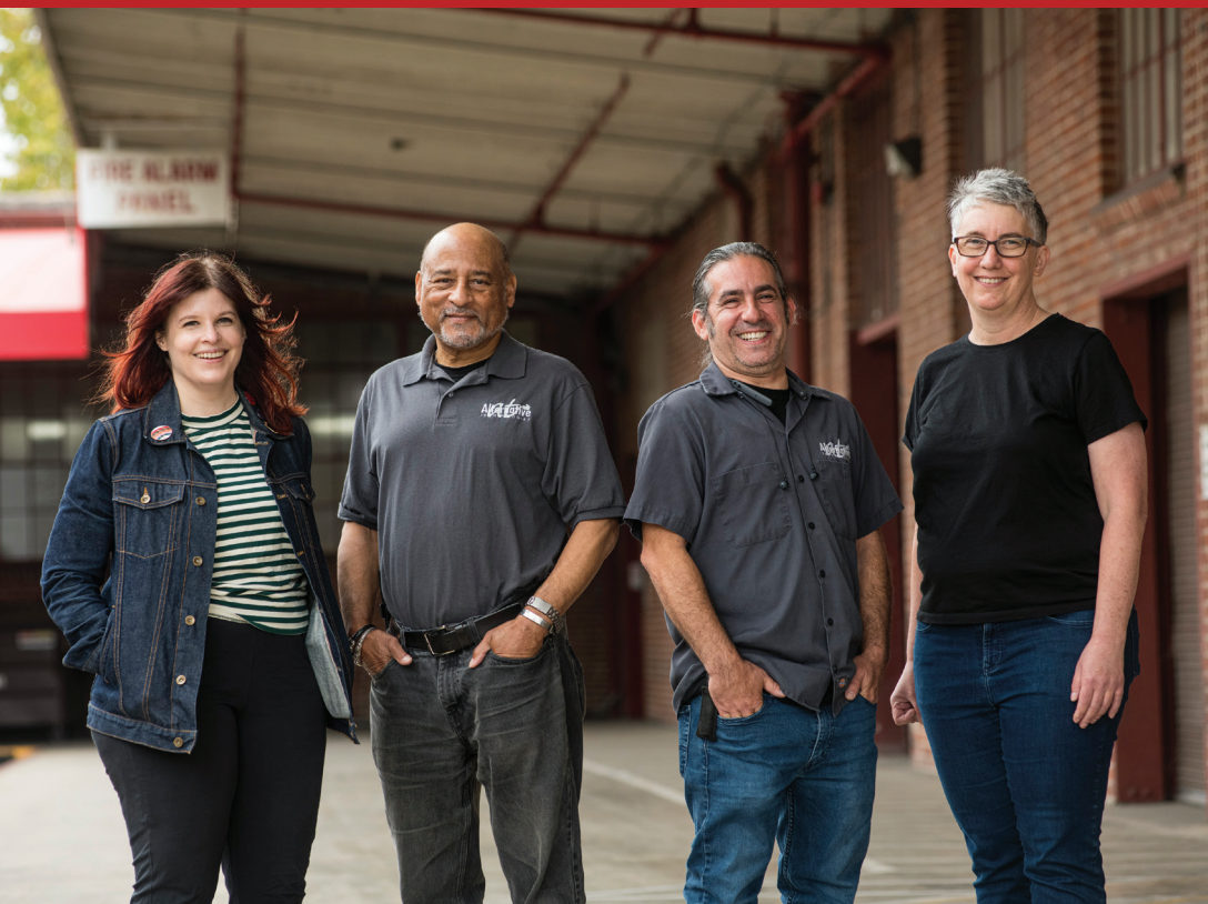
Employee-owners at Alternative Technologies