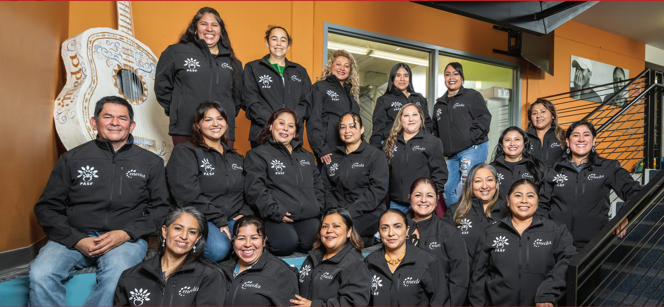
Cooperative members at Promotoras Activas SF