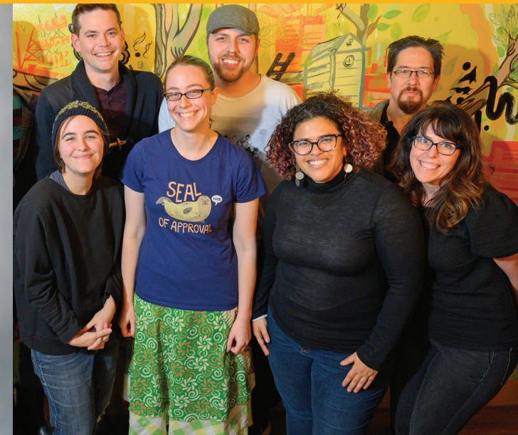
Employee-owners at Happy Earth Cleaning